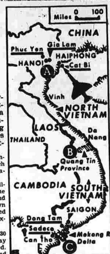
Plane emblem points to jet strip at Cat Bi, hit by U.S. planes for the first time Sunday.

SAIGON (AP)—American Navy planes today attacked and left burning a sprawling military compound near Haiphong where Russian missiles and helicopters are uncrated and assembled.