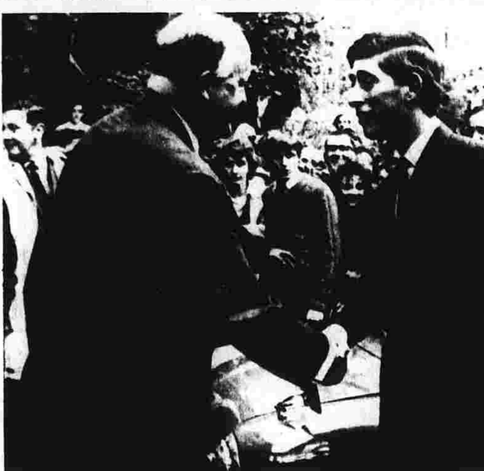
Prince Charles of Britain is greeted by Lord Butler, master of Trinity College, as he arrived yesterday at Cambridge University for the start of the fall term. A crowd of about 2,000 was on hand to greet him as he began his college career. He will study archaeology and anthropology.